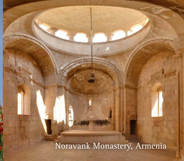
Noravank Monastery, Armenia