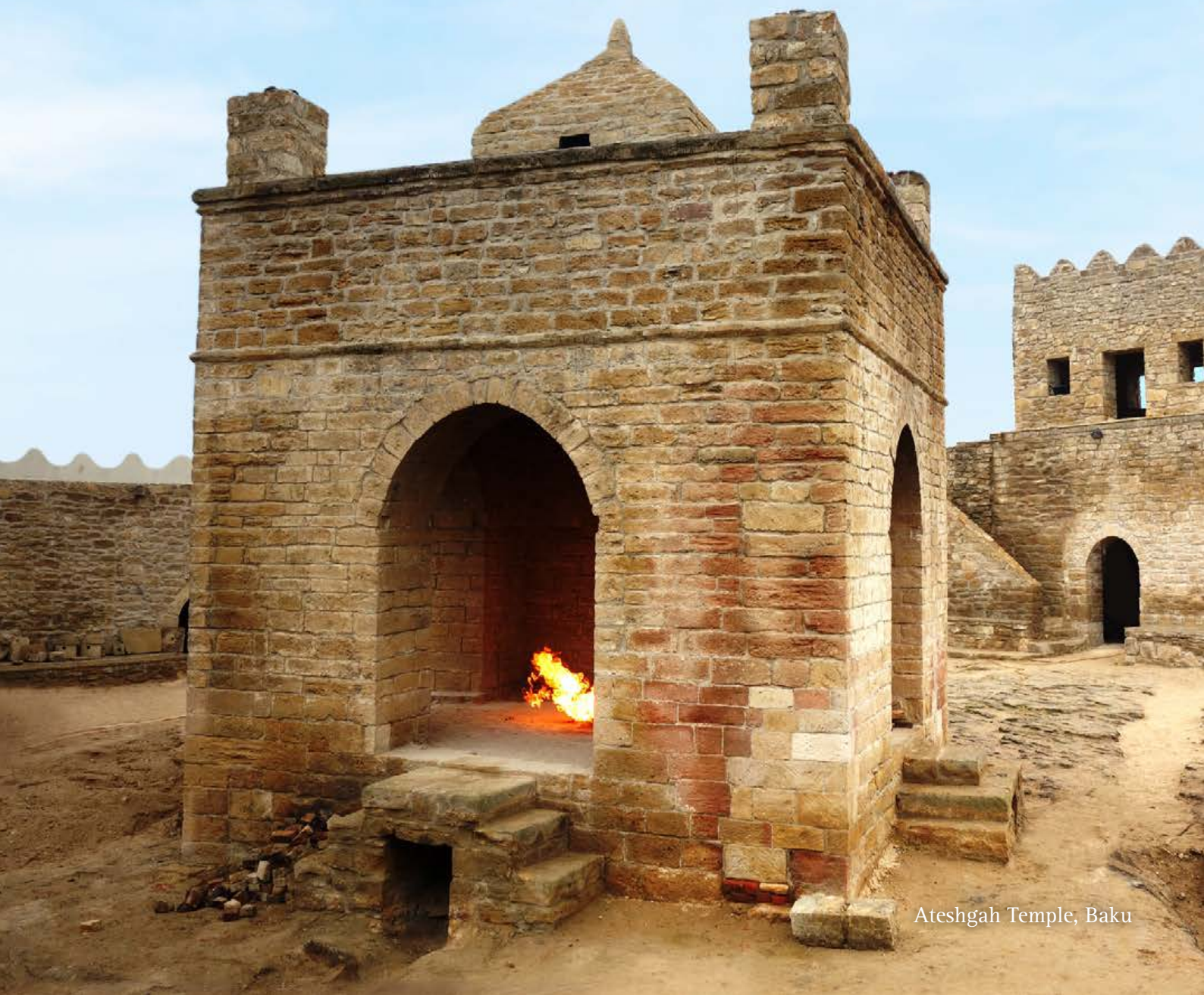
Ateshgah Temple, Baku

A VIP Tour of the most enthralling and emerging capitals of Europe