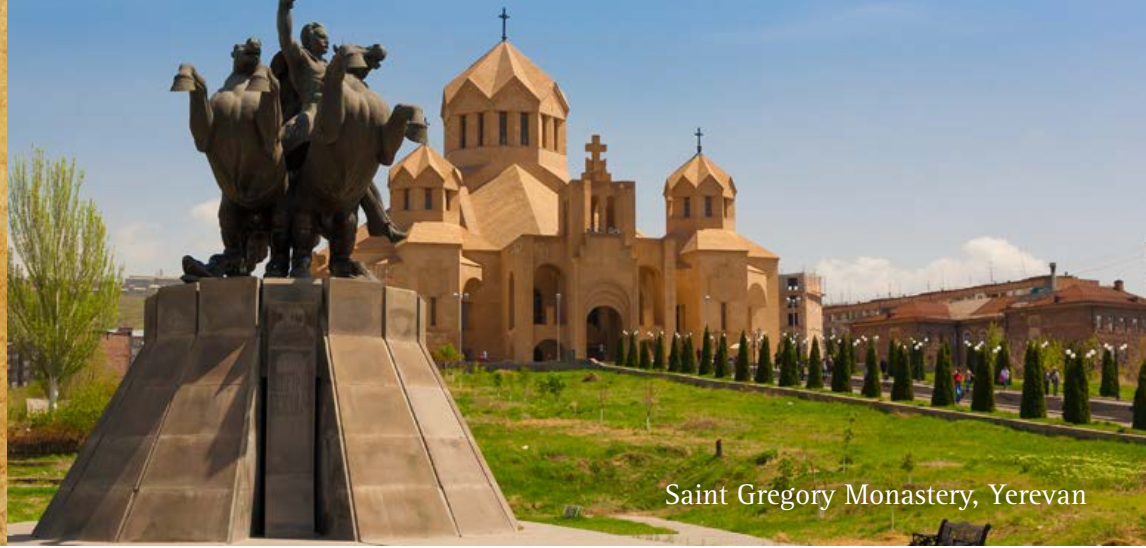
Saint Gregory Monastery, Yerevan