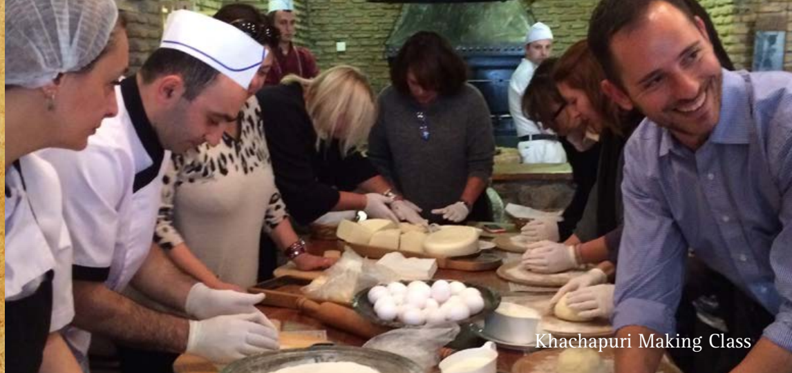
Khachapuri Making Class