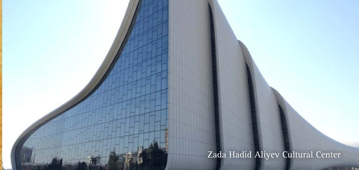
Zada Hadid Aliyev Cultural Center