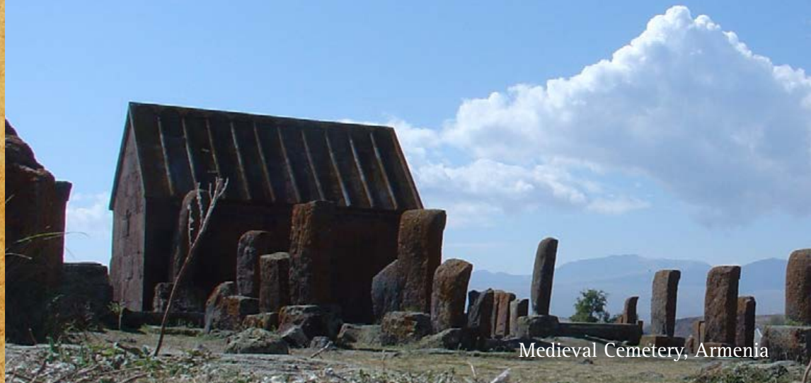
Medieval Cemetery, Armenia