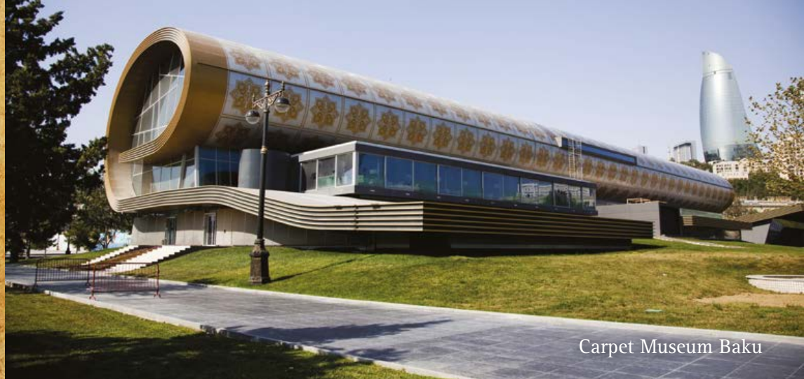
Carpet Museum Baku