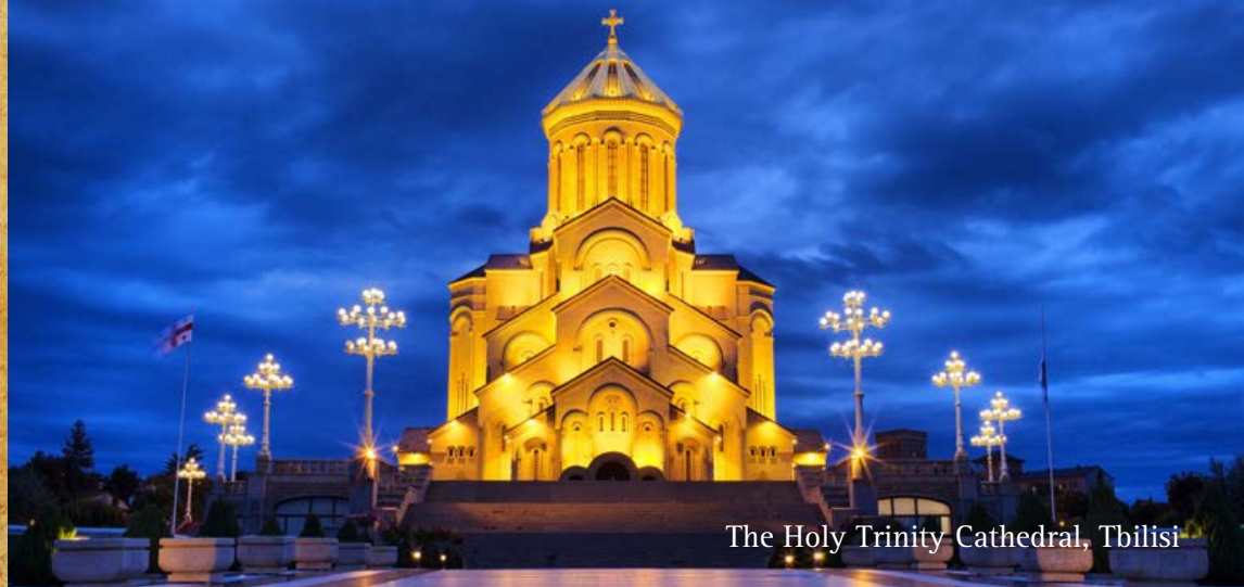
The Holy Trinity Cathedral, Tbilisi