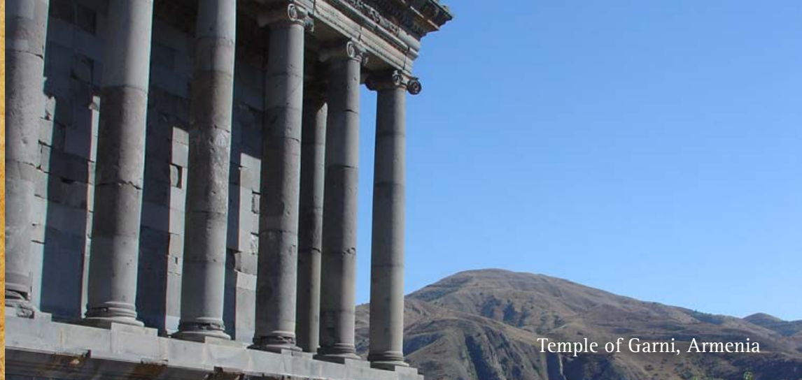
Temple of Garni, Armenia