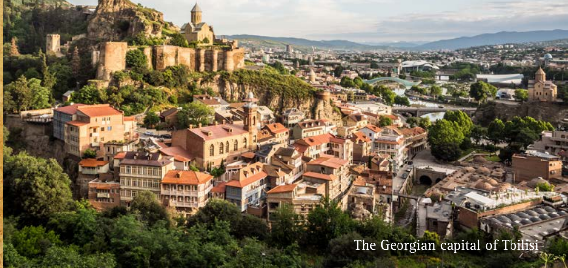
The Georgian capital of Tbilisi