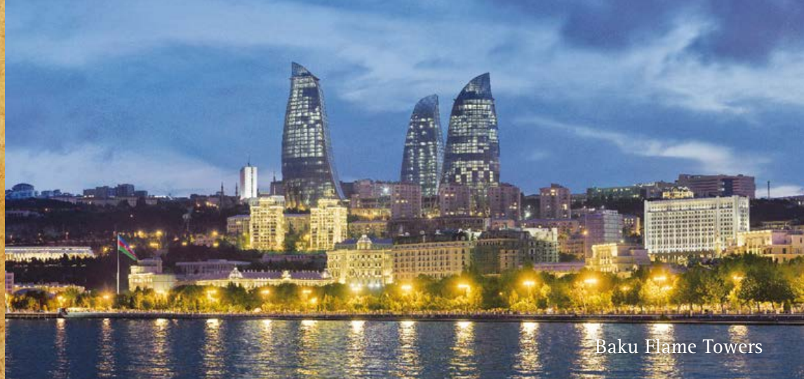
Baku Flame Towers