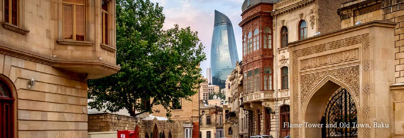
Flame Tower and Old Town, Baku