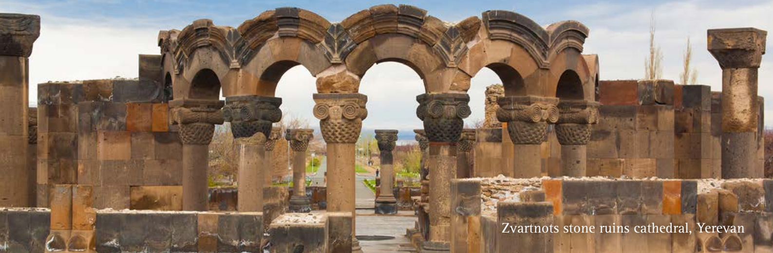
Zvartnots stone ruins cathedral, Yerevan